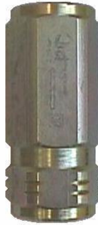
10305-048 (for identification)